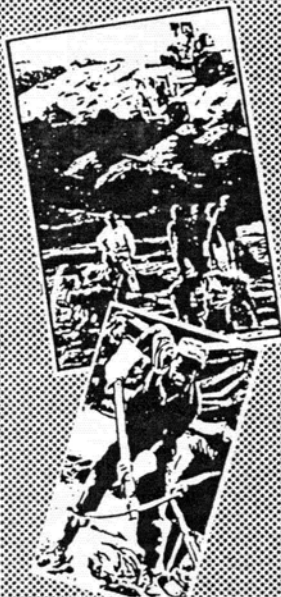
Namibian Uranium Mines

12 noon: rally with speakers from Namibia, the NUM, peace movement. . .