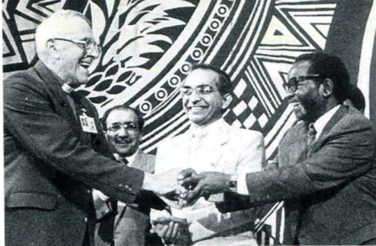
Abdul Minty, with Archbishop Huddleston and Oliver Tambo