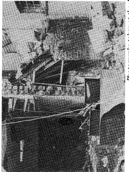
Photographs taken at the ANC office on 14 March 1982