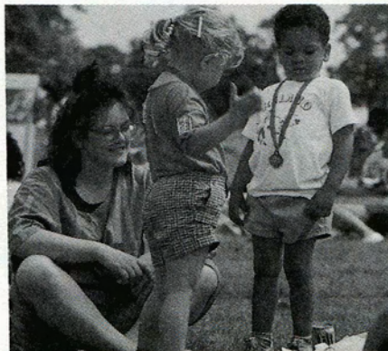
Children can enjoy the day, too!

This year we are asking entrants to raise at least £20 from sponsors. (This is only £2 a km if you do the 10km run). For this minimum amount you can be entered into a Prize Draw, as detailed in this leaflet.