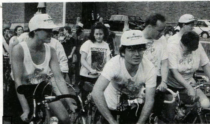
Join in the many local events this year