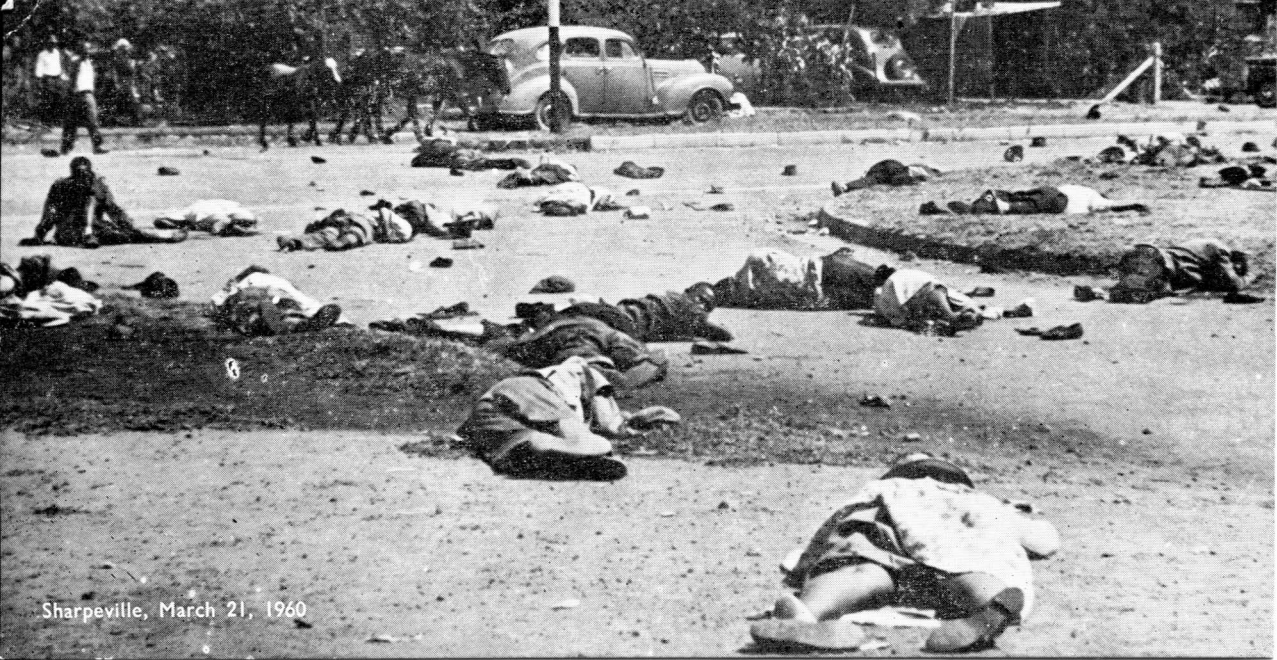
Sharpeville, March 21, 1960